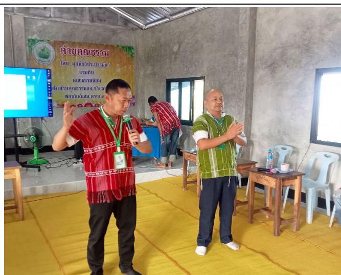
Presentation of Dharma in the monastery main room