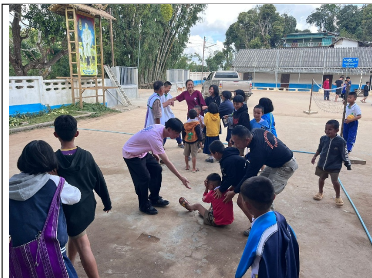
School students’ activities