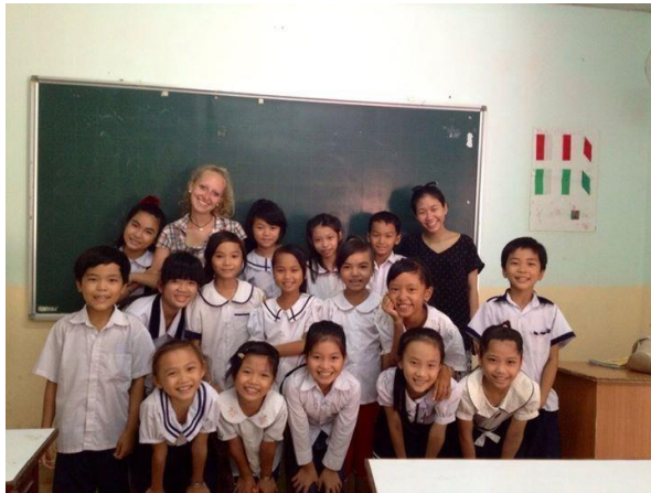
A good experience with local teachers and students

experiences through working independently, making lesson plan and creating their own activities in the class.