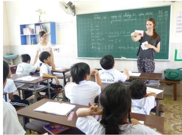
How students enjoy the presence of volunteers