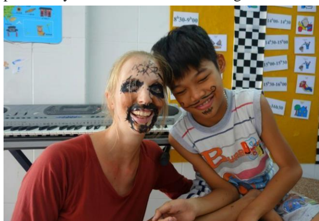
Learning about colours and decoration

For this project children are orphan or abandoned/street children and they are not disabled. The main work will be spent time with children, playing with them, care to them and help them to feel warm on their normal difficult life. A part from caring work, there will be a possibility to do some basic teaching.