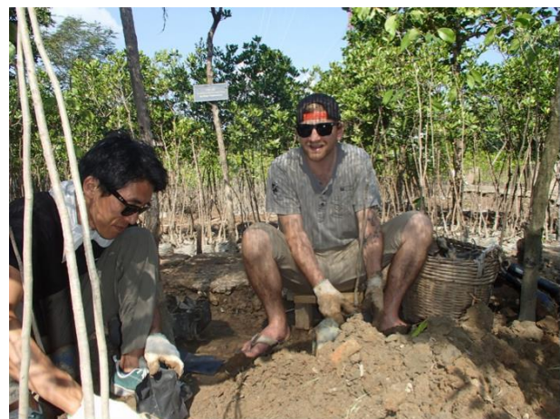
Working at the tree nursery